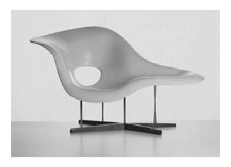
Figure 1: La Chaise (1948)

Their molded plywood chairs and tables were light, durable, and affordable; making them ubiquitous in the mid-century domestic, educational, and commercial landscapes.