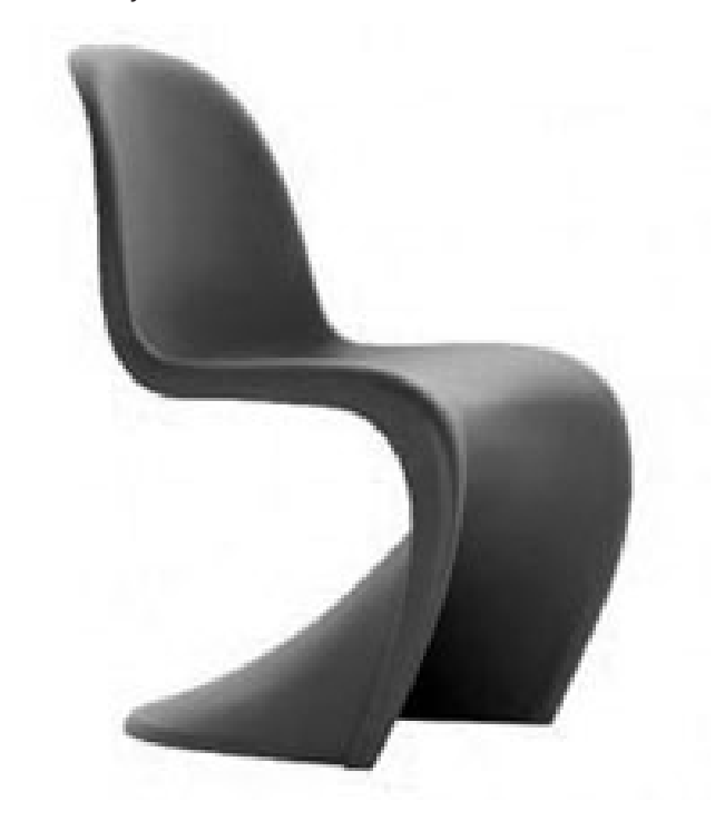
Figure 2: Panton Chair (1959)

The designer Verner Panton, a formal innovator across the field of furniture, introduced the Panton Chair, the first "single-material, single-form, injection-molded chair" for the commercial market.<sup>6</sup> The chair exists as one languid sweep, existing simultaneously as seat and structure, all whole and no parts (Figure 2). The chair is commonplace in the interiors of contemporary buildings with an expressive fluidity.