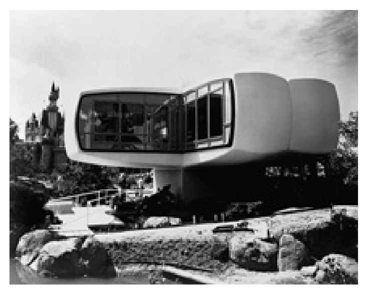
Figure 5: Monsanto's "House of the Future" (1957)

Across America, the "House of Tomorrow" was envisioned, and often built, by myriad architects and industrial designers. Noteworthy examples include the Hurricane House by Edward Koch, which repositioned itself according to the weather; and the Chemosphere House by John Lautner, which hovered over any landscape on a single support column.