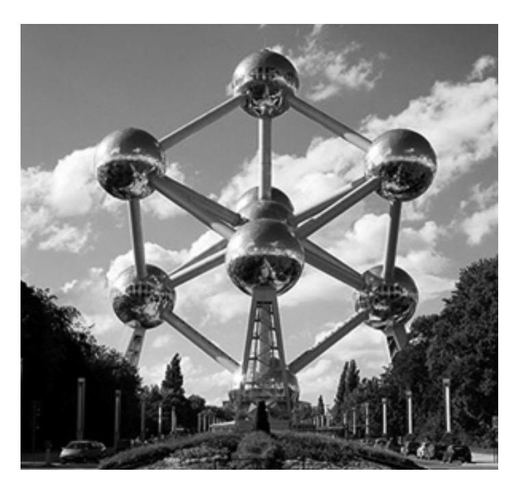
Figure 4: The Atomium (1958)

Every culture tends to extrapolate their current cultural trajectory forward into the future, and the mid-century was no exception. Science and technology were to continue solving the small problems of everyday life, and the global problems of hunger, politics, and land availability. Designers would continue to incorporate new materials and equipment into objects and buildings, constantly reinventing and asking 'what if?' "Housewives of tomorrow would wash down the drain dishes made of meltable plastic and take their old nylons to chemical factories to be converted into candy."